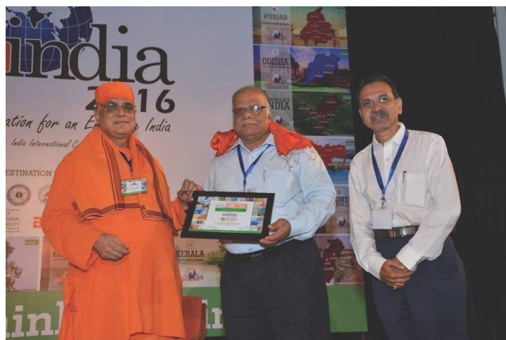
The University was bestowed with the eduDESTINATION AWARD-2016 for the city of Vijayapura, which was conferred upon on October 18, 2016 at India International Centre, New Delhi during eduINDIA-2016 .